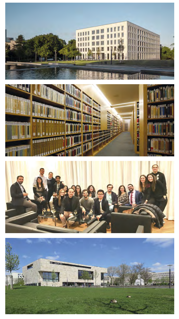
Official website of Goethe University: www.uni-frankfurt.de